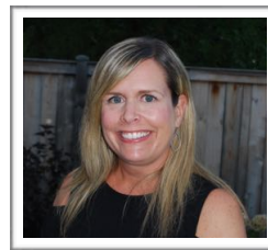
Beth Lome Turtles